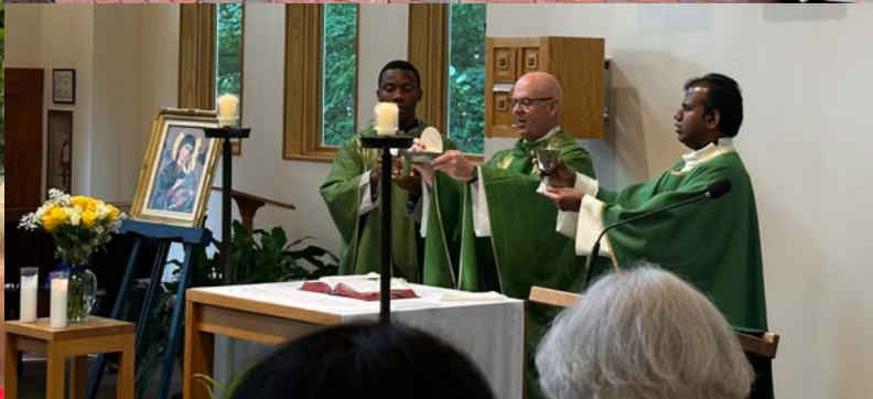
A celebration of Our Lady with members of the Filipino community in attendance.