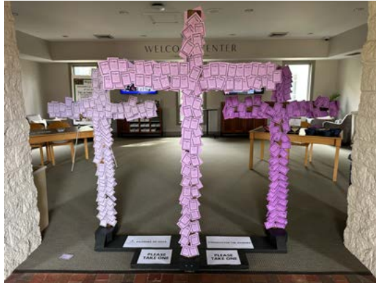
Stop by the Welcome Center and take a note from one of the three crosses for activities during Lent: Fasting, Prayer, and Almsgiving.