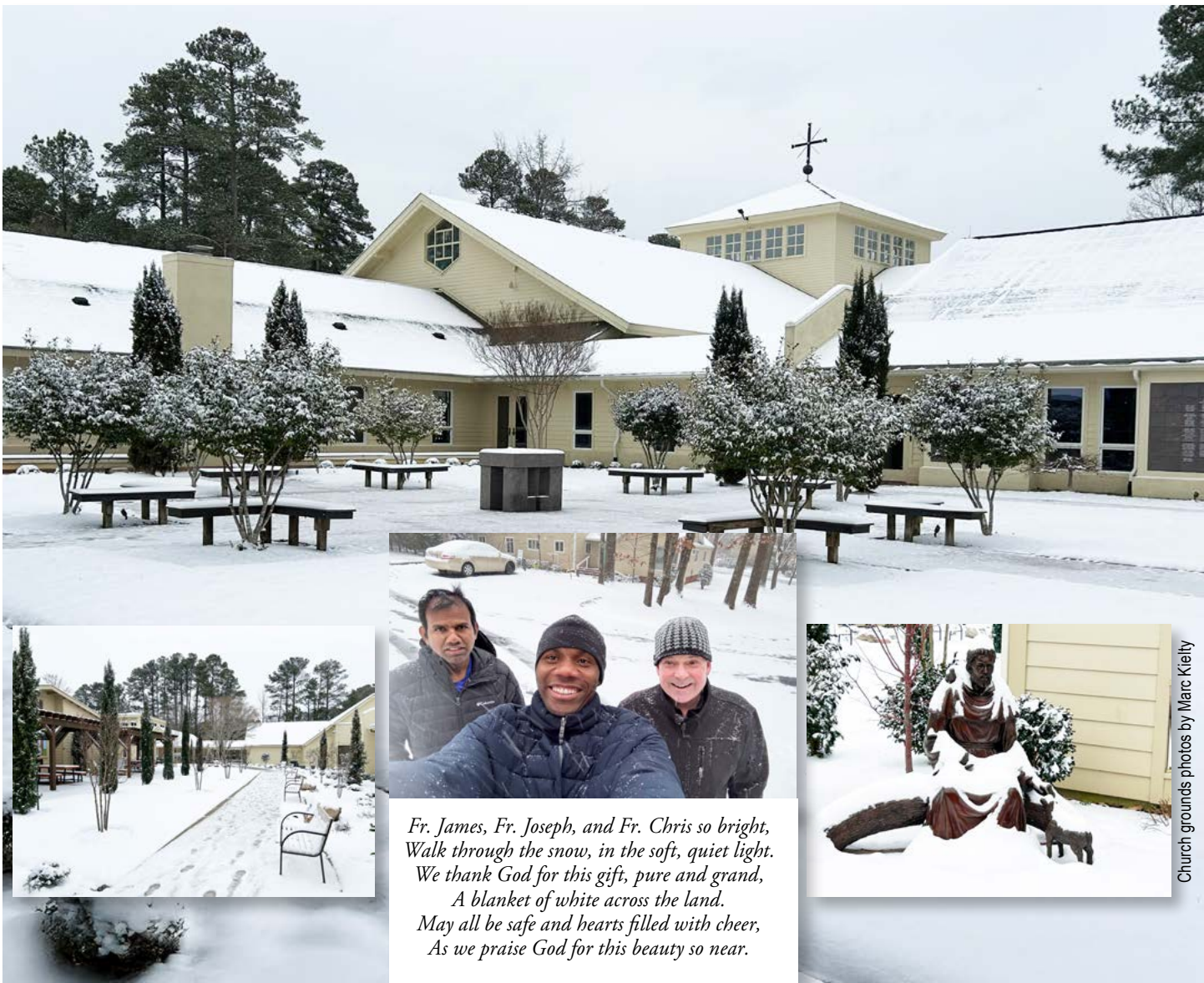
Church grounds