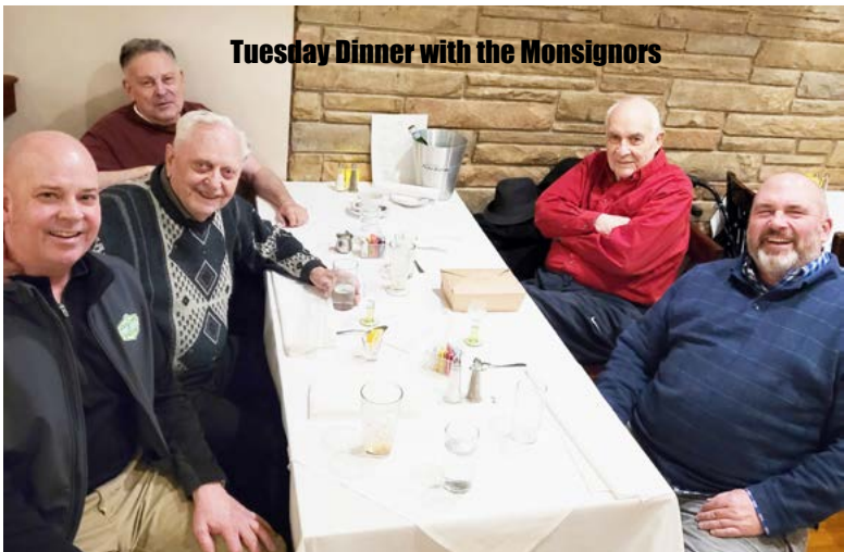
Tuesday Dinner with the Monsignors