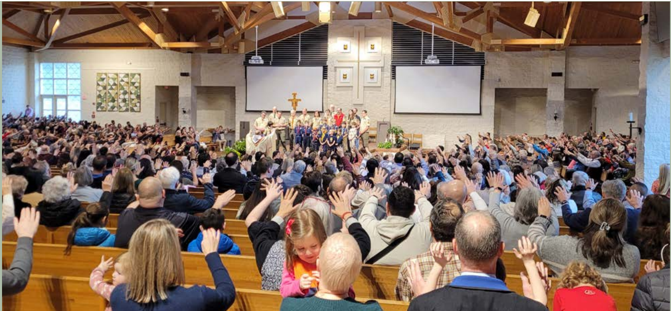
Scout blessing with active participation on Sunday