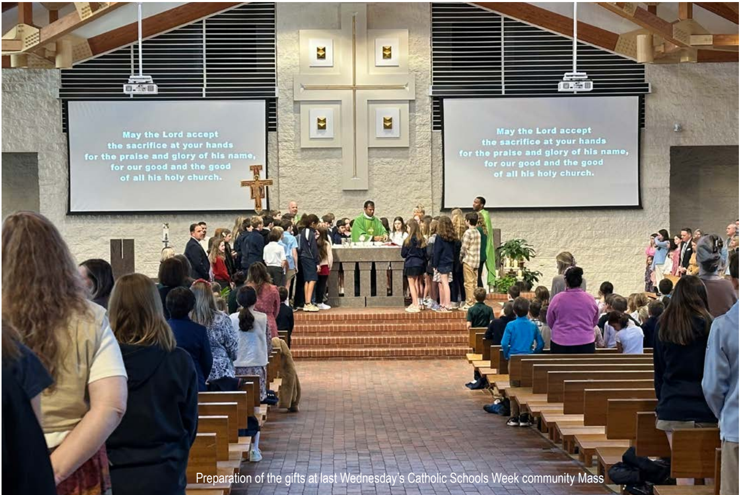
Preparation of the gifts at last Wednesday's Catholic Schools Week community Mass