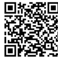
Scan the QR code to give

Text-to-Give: From your smartphone screen, create a new message. Click the "To:" field and enter 919-629-1199. Enter the dollar amount then tap the link to complete your gift. Register your credit/debit card.