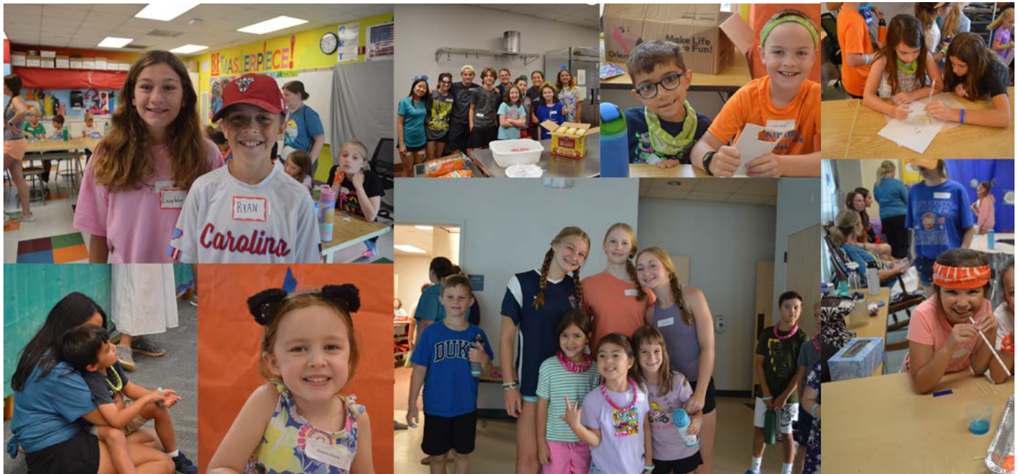
Vacation Bible School Highlights