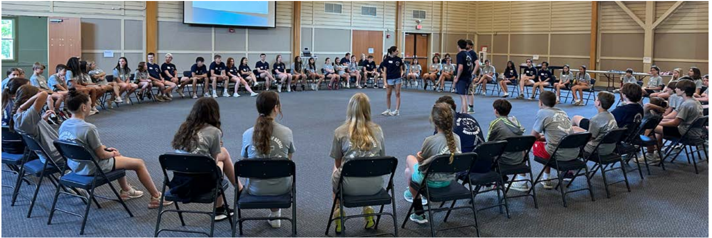
Mercy Camp is in full swing at St. Francis as youth participate in a series of fun faith-filled activities.