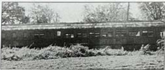
St. Peter's Chapel Car. This Passionist ministry traversed North Carolina from 1925 to 1941 by way of local railroad tracks with the purpose to preach the Gospel to scattered Catholics