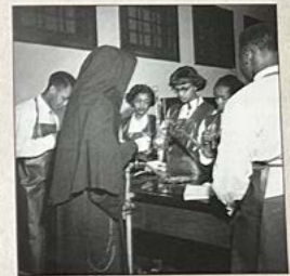
When the IHMs staffed Mother of Mercy School in Washington, NC, the Passionist priests served in the parish.