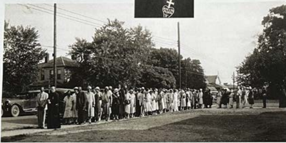
A Passionist priest in leading a procession at St. Monica, Raleigh