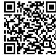
Scan the QR code to give

Interesting Financial Factoid: From a financial standpoint, the Parish is divided into four separate budget areas. The Church, The Franciscan School (TFS), St. Francis of Assisi Pre-School, and Columbarium each manage their own income and expense budgets. The fiscal year starts on July 1st and ends on June 30th. Please note we have Text-To-Give and QR Code options for people who would like to make a one-time donation to the Church. Your support is appreciated by the ministries that serve our community. Thank You. Please Click Here to Give