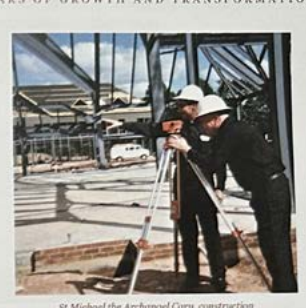
of the new church which was dedicated in 1996

Incredibly, the diocese did not just meet its goal it nearly doubled it. It was a testament to the generosity of the people of eastern North Carolina, their trust in the future, and their deep affection for Bishop Gossman.