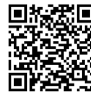
Scan the QR code to give

Please note we have Text-To-Give and QR Code options for people who would like to make a one-time donation to the Church. Your support is appreciated by the ministries that serve our community. Thank You. Please Click Here to Give