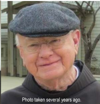
Photo taken several years ago.