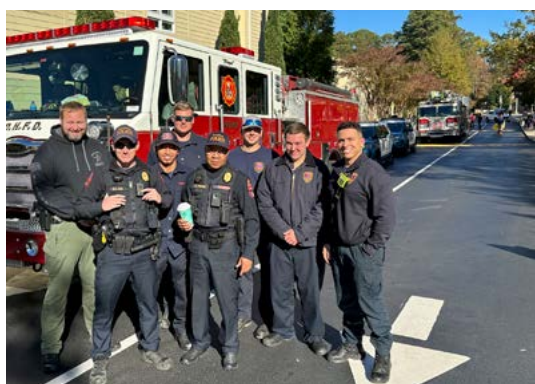
Photo from this year's First Responder Parade