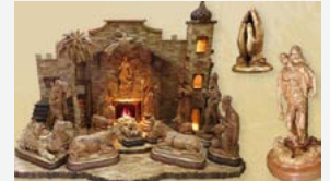
Little Bethlehem Christian Group