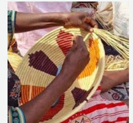
The Mighty River Project