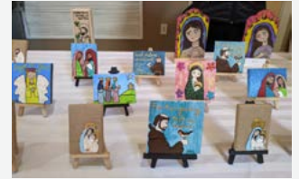
La Casa del Arte