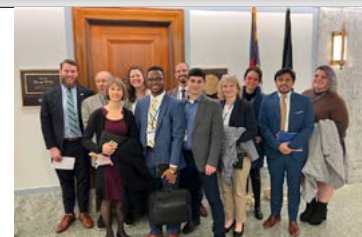
Love Through Advocacy Click here to read story

The parish offices will be closed Good Friday through Easter Monday. Morning Mass on April 10 will be held in the church. Parking lot maintenance will be ongoing all week. Please follow posted directions. Any unattended cars or cars parked in restricted areas during this time will be subject to towing.