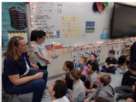
Barb Dobner Kindergarten

Click the image above to read the article.