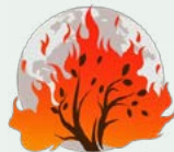
The Burning Bush

Sunday, November 13th Sunday, March 26, 2023 Sunday, January 29, 2023 Sunday, April 2, 2023 Sunday, February 12, 2023 Sunday, May 7, 2023